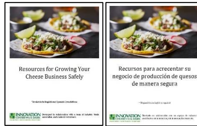
Checklist/Guidance Artisan/Fresh/Hispanic Styles