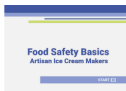
Ice Cream bit.ly/36tUPQh

Online training courses designed for small to medium cheese, ice cream, and frozen dessert manufacturers by food safety experts from dairy processors and academia (NCSU, UConn, Cornell, UW). Each is divided into short modules to fit your schedule. They cover the importance of food safety, hazards, control strategies, GMP's, sanitations, and environmental monitoring.