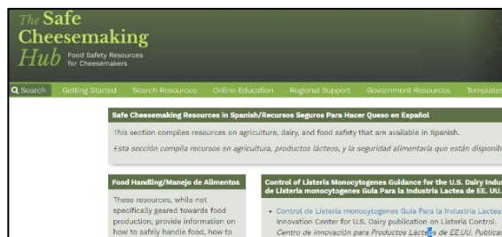
Safe Cheesemaking Spanish-Language Resources

The team has developed two Food Safety websites for Artisan, Farmstead, and small dairy processors which are hosted by ACS (Cheese focused) and IDFA (Ice Cream). Each site includes a ‘Resources in Spanish section’