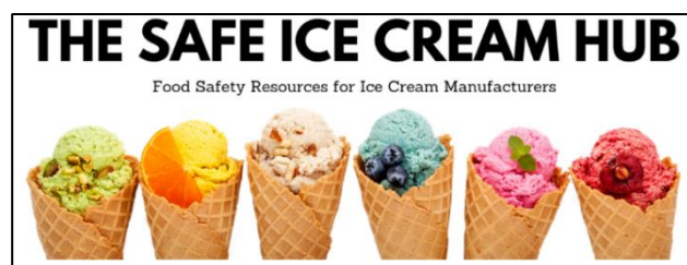
Safe Ice Cream Spanish-Language Resources