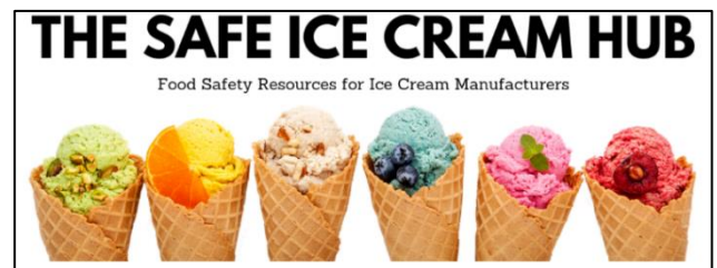
Safe Ice Cream Spanish-Language Resources