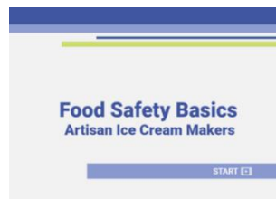
Ice Cream bit.ly/36tUPQh

Online training courses designed for small to medium cheese, ice cream, and frozen dessert manufacturers by food safety experts from dairy processors and academia (NCSU, UConn, Cornell, UW). Each is divided into short modules to fit your schedule. They cover the importance of food safety, hazards, control strategies, GMP's, sanitations, and environmental monitoring.