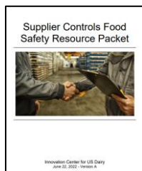
Supplier Controls Guidance & Templates