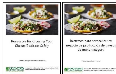
Checklist/Guidance Artisan/Fresh/Hispanic Styles