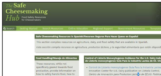
Safe Cheesemaking Spanish-Language Resources

The team has developed two Food Safety websites for Artisan, Farmstead, and small dairy processors which are hosted by ACS (Cheese focused) and IDFA (Ice Cream). Each site includes a 'Resources in Spanish section'